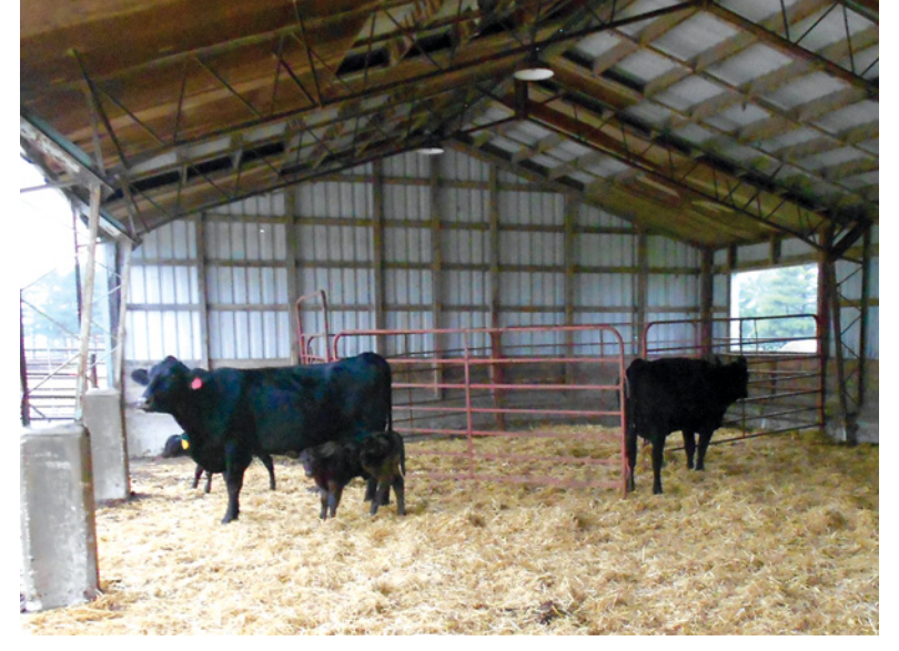
Figure 4. Protected bedding areas important for calves.

source. Placing the calf in warm water (105°F) is the most effective warming method but may not be practical in some circumstances. A hot box can be used but temperature should not exceed 105°F and ventilation is required to provide adequate oxygen and reduce moisture buildup. A calf that has a core body temperature of 90°F can be rewarmed in about