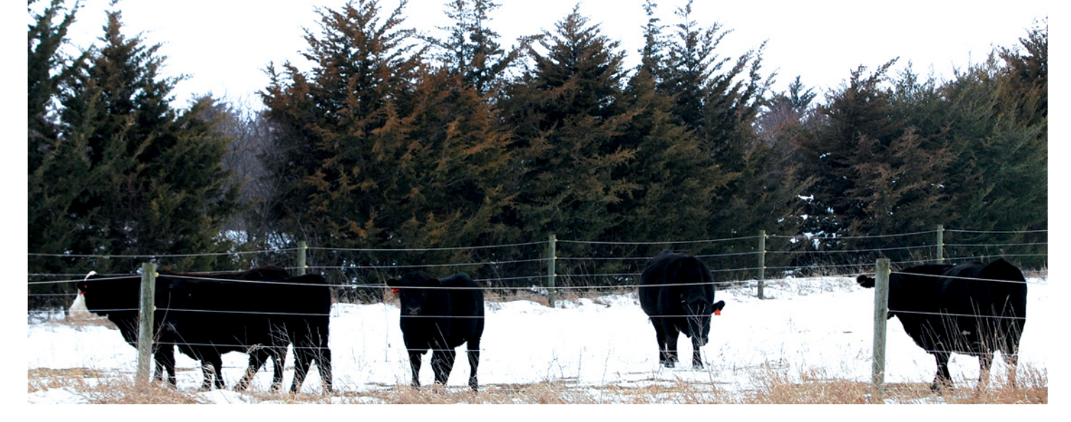
Figure 2. Cattle sheltering behind a natural windbreak.

Natural windbreaks such as timber or brush can be effective and low-cost in some areas if located close to the winter feeding or calving areas. Temporary windbreaks using hay or stalk bales are inexpensive and can be positioned where they are needed, although snow dropping behind the windbreak due to their solid nature may limit their effectiveness.