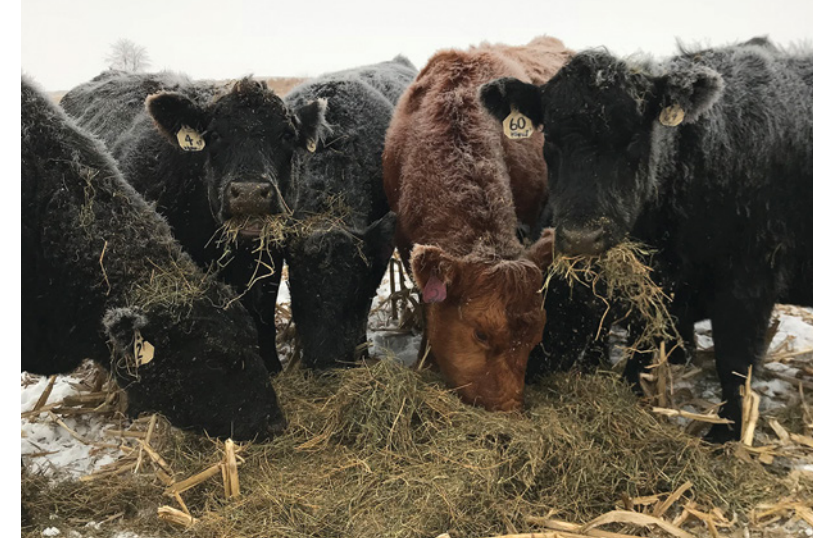
Figure 3. Cows need supplemental feed in winter.

Cold stress increases maintenance energy requirements but does not impact protein, mineral or vitamin requirements. As a general rule of thumb, for every degree that the temperature is below the Lower Critical Temperature (LCT), a cow's energy needs increase by 1%. For example, with every